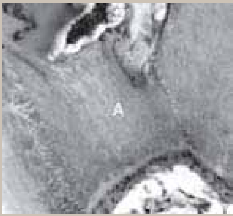
FIGURE 3- White Portland cement (120 days). H.E. 40 X. (A) Dentin bridge

sue free of inflammation and necrosis after 120 days.