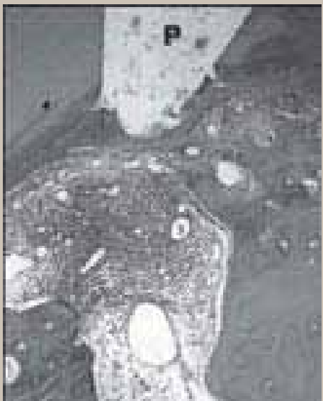
FIGURE 3- WPC, with complete new formation of mineralized tissue at the site of perforation (P), organizing periodontal ligament, regardless of the inflammatory infiltrate. Hematoxylin and eosin – Olympus 10X